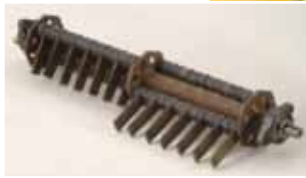
Optional TS010 Flail Blade Assembly