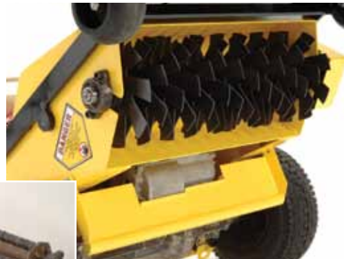
Heat Treated High-Carbon Steel Renovation Knives Standard

Save time, save money, save steps with a StepSavr.™