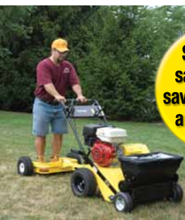
See Optional PL050 StepSavr on Page 14

Save time, save money, save steps with a StepSavr.™