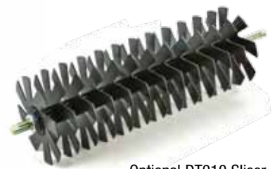
Optional DT010 Slicer Knife Assembly