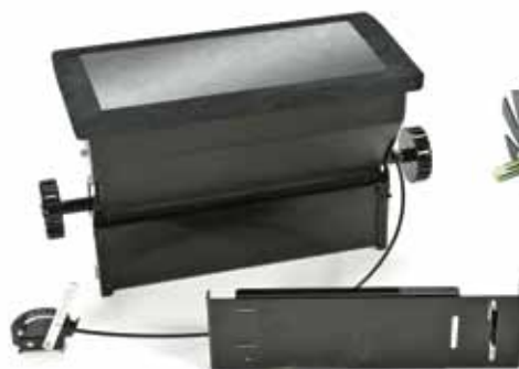
Optional DT020 Seeder Kit