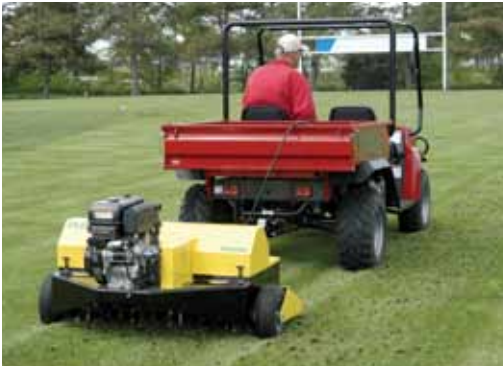
Tow Pro with Utility Vehicle