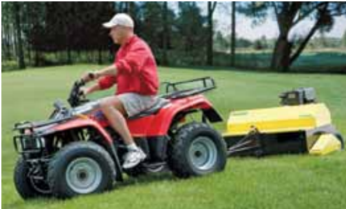
Tow Pro with All Terrain Vehicle