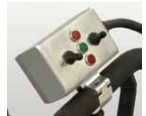
Operator Friendly Controls to Raise and Lower