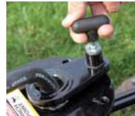
Pull the Lock Pin to Offset to the Left or Right

TOW PRO operation is controlled by a simple operator panel attached to a flexible cable. The universal mount attaches to virtually any tow vehicle for quick and easy operator response. Features include single switch tine disengagement to skip over sprinkler heads without stopping or turning and a transport mode switch to increase ground clearance for loading. Indicator lights will warn you when you are moving too fast or too slow so you get quality aeration at all times.