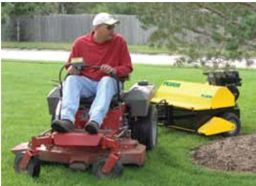
Mow and Aerate in a Single Pass without Dragging Down Mower Power

Now you can achieve Plur results with even greater productivity and reduced operator fatigue. Plur TOW PRO aerates a 45" swath in a single pass. Its unique tongue design allows maneuverability on large, heavily landscaped properties. With capacity up to 84,000 square feet per hour and an operating speed of 3–4 mph, you'll aerate more, aerate better and have energy to spare.