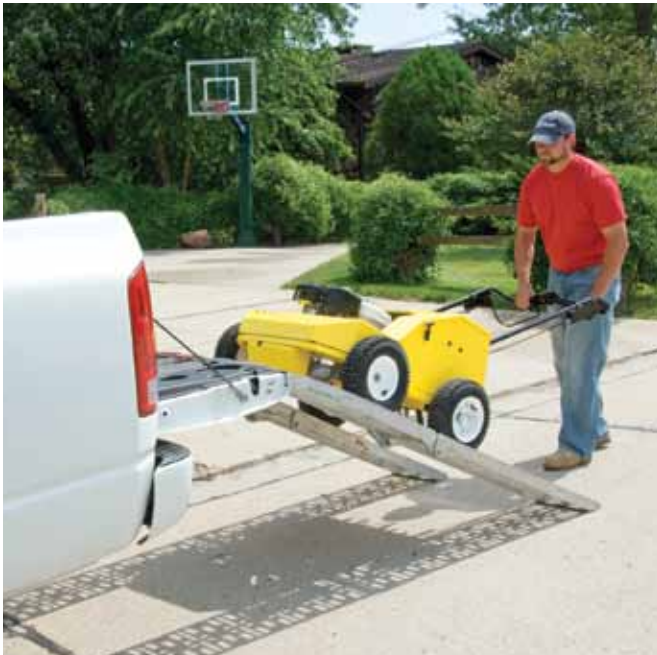
Easy Self-Propelled Loading