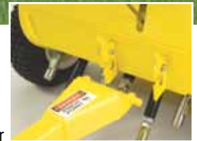
Built-In Quick Release Receiver Hitch for Optional PL050 StepSavr