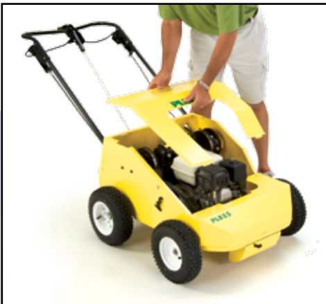
Easy, No-Tool Maintenance Access